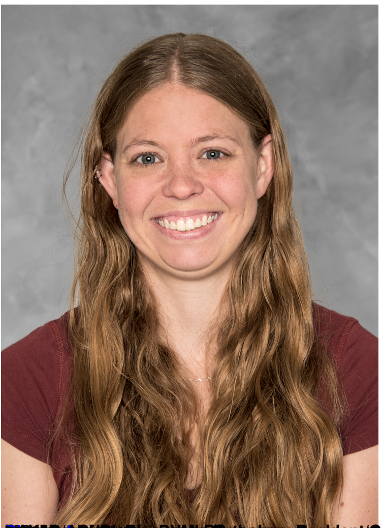
TOWNS A DATE IN THE PROPERTY RESIDENT/Graduate Student Award