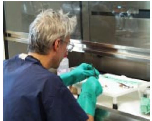
Pathologist trimming fixed tissues in a fume hood for histology blocks

The NCFAD is located within a $142- million facility operated jointly by the CFIA and Health Canada's Bureau of Microbiology, the laboratory component of the national organization responsible for the identification, investigation, control and prevention of human disease. The Bureau relocated to Winnipeg in summer of 1998 and will phase in operations during 1999.