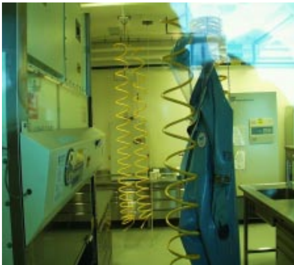
Biosafety level 4 laboratory showing a space-suit", air lines, and biosafety cabinet.

The joint laboratory complex contains Canada's first Level 4 biocontainment laboratories as well as Level 2 and 3 facilities. The six-story building is approximately 29,000 square meters on a 15- acre site located in a mixed industrial, commercial and residential neighborhood. Besides laboratory space, the state-of-the-art facility includes an animal wing containing Level 3 and Level 4 laboratories and animal cubicles designed with the involvement of the Canadian Council on Animal Care. The complex also contains administrative and operations offices, a library, cafeteria, 137-person capacity theatre, and parking for the 220 employees. Three of Manitoba's major centres of medical research are located nearby.