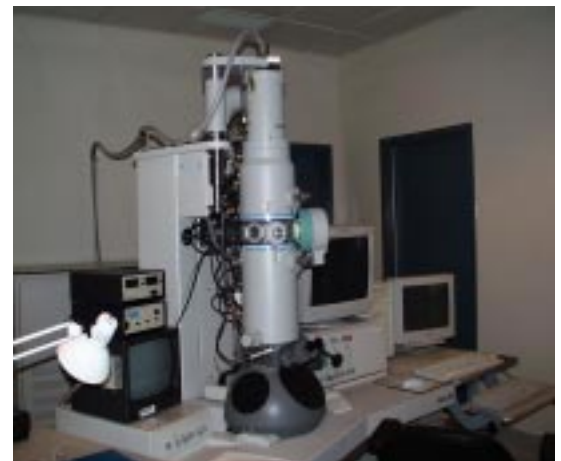
Philips CM 120 transmission electron microscope

In addition to the laboratory component, the NCFAD houses the Centre for Policy and Epidemiology in Foreign Animal Diseases (CPE-FAD). This