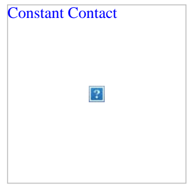
Try it free today